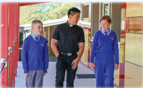
Following the spirit of Jesus