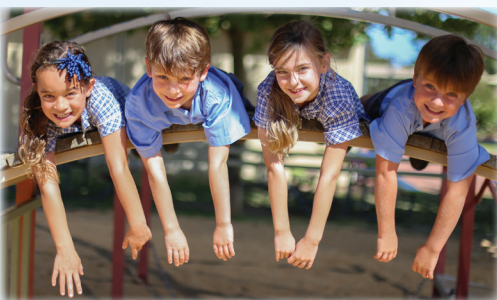
Creating special memories