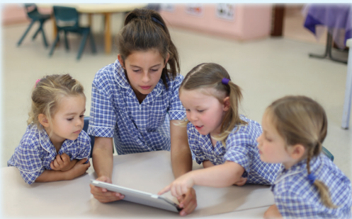
Striving for excellence