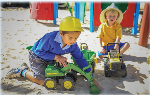
Building good citizens and a strong community