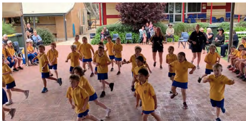
Year 1/2 Dancesport moves!