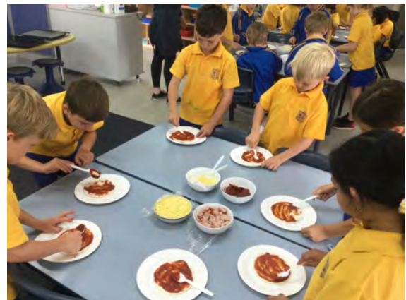
Making pizzas in Yr1/2 ....