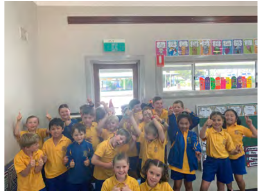
Tinsel, the Yr1/2 Elf on the Shelf appears!

We have had the best time and made great memories this year. We are sad that our year is coming to an end, however, we are excited for the final events for this term and the Christmas holidays!