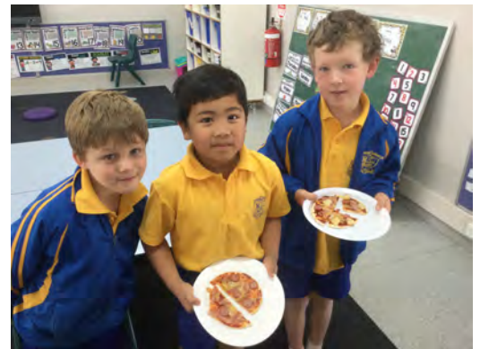
... and then cutting them into fractions!