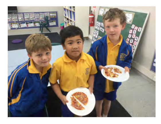
... and then cutting them into fractions!