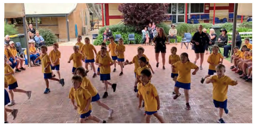
Year 1/2 Dancesport moves!